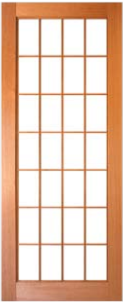
Design 1 The Kyoto