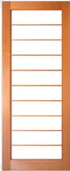
Design 3A The Geisha