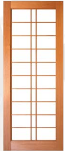
Design 7 The Tokyo