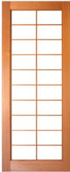
Design 3 The Fuji