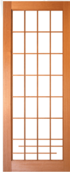
Design 4 The Nara